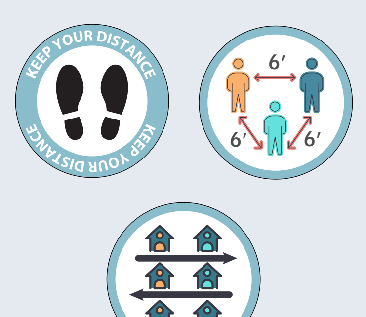
Multi Level Signage Keeps Participants Healthy