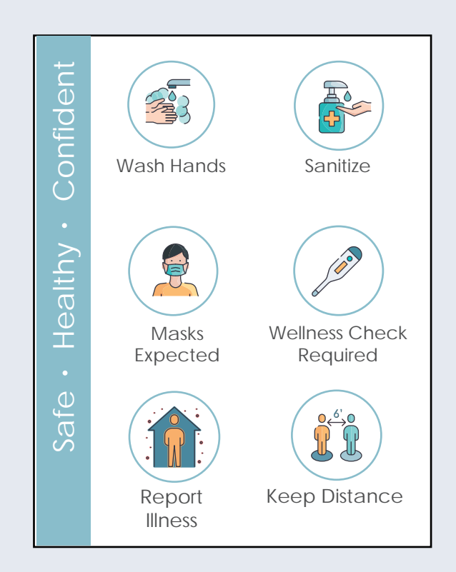
Communicate Expectations With Clear Signage